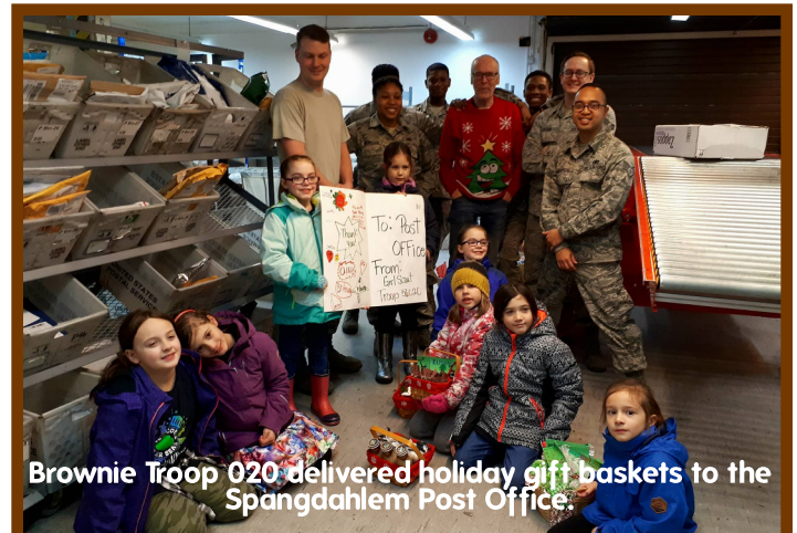
Brownie Troop 020 delivered holiday gift baskets to the Spangdahlem Post Office.