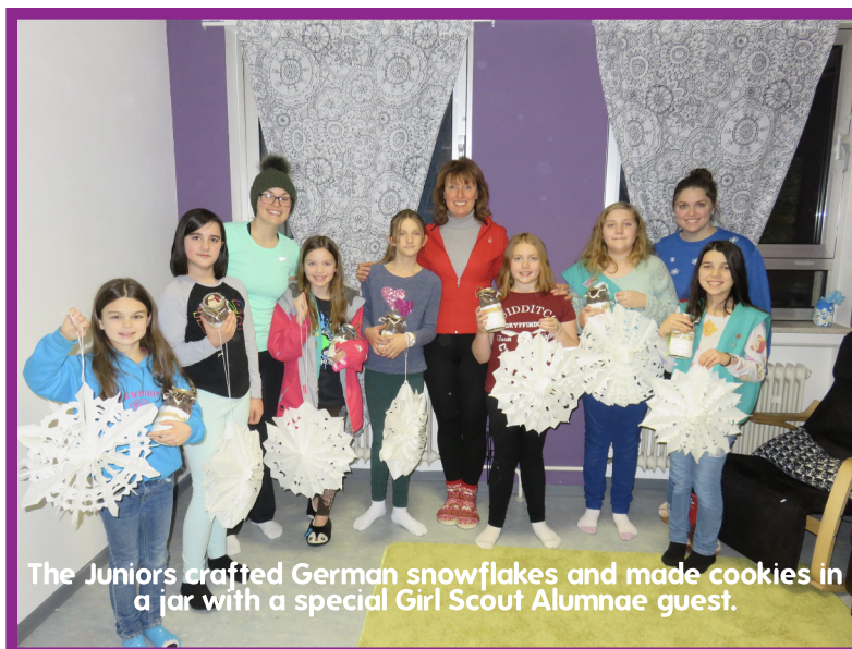
The Juniors crafted German snowflakes and made cookies in a jar with a special Girl Scout Alumnae guest.