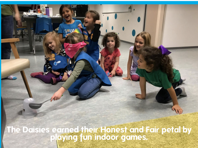
The Daisies earned their Honest and Fair petal by playing fun indoor games.